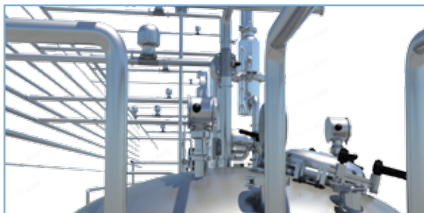
LOOP & PROCESS PIPING

We understand pharmaceutical water better. We have generated a lot of data and expertise spanning over the last 14 years, A fully integrated manufacturing facility with in-house electropolishing, trained and experienced engineers and our well proven after sales service infrastructure has ensured the trust of our customers, time and again. Ability to design, manufacture and install Turnkey Water Systems is one of our key strength. Well trained sales team capable of analysis and support during pre and post sales is another area that we excel. Design consistency, manufacturing excellence and timely support is our forte.